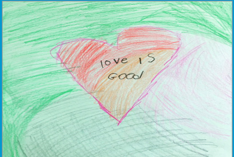
Artwork of an 8yrs old resident

Give back with amazon smile You shop. Amazon gives.