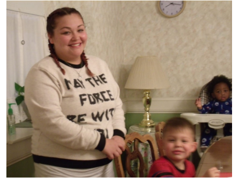
Dinner Time with residents

Bethel Baptist St. Eleanor Church Centennial Lutheran Saint John's Lutheran Charlestown United Methodist St. John's UCC East Vincent UCC St. Matthew Lutheran First Presbyterian Church St. Michael Archangel First United Methodist St. Peter Episcopal Grace Lutheran St. Peter Lutheran Holy Ghost Church St. Teresa of Calcutta Quaker Meeting House St. Vincent UCC Royersford Baptist Church United Methodist VF Sacred Heart Royersford Zion Lutheran St. Ann Church THANK YOU ALL! St. Basil the Great