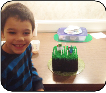
Last Month's birthday celebrations!