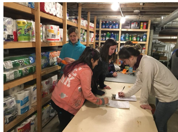
Kimberton Waldorf School

Students from Kimberton Waldorf School marked Martin Luther King Day with service to our families. Their gifts of time and talent (and amazing strength) made it possible for us to complete the installation of our new computer lab. The computer tables were here but the task of putting them together required the minds of these young entrepreneurs. With some competition and engineering, they completed the task with perfection! Simultaneously the students formed a second group to use their organization and management skills to reorganize, clean and sort the areas of supplies. These supplies will be used for our families while they are living with us and packed for each family to take with them to their new home. Thanks to Kimberton Waldorf for their generous service to us.