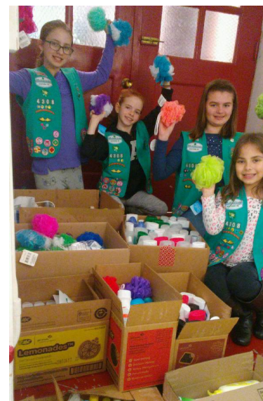
Manavon Girl Scouts