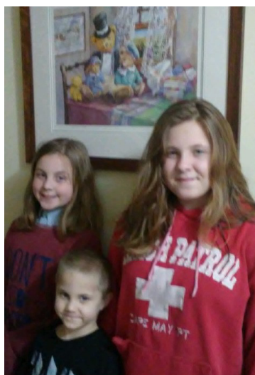
St Teresa of Calcutta

A remarkable family from Saint Teresa of Calcutta School came to St. Mary's laden with sweets and desserts to share with our families. Seeing the compassion and dedication of these young children lifted our hearts. The future of volunteering, philanthropy and caring for other is alive and well in our neighborhood. We are so happy for their loving and understanding way.