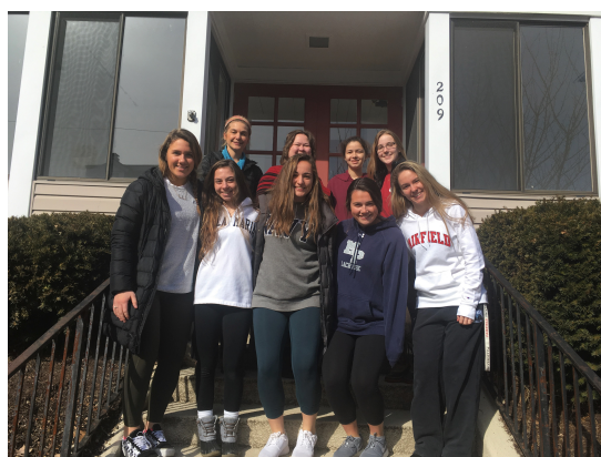
Villa Maria Academy

Villa Maria Academy returned this year to give to the families of St. Mary's a day of caring service.