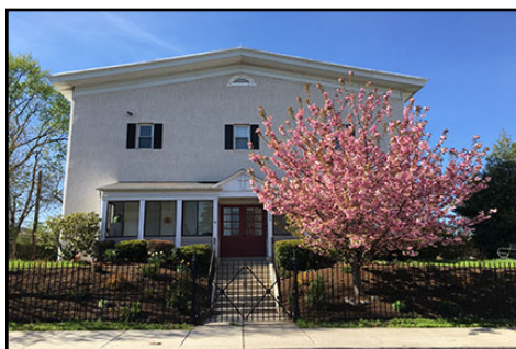
Spring Blooms at the shelter

What else does hope, love and gratitude look like? It looks like the "Play parents" who take the children for an hour of activity while their