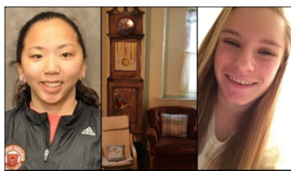
Ursinus College students make the playroom more meaningful